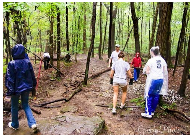
Volunteers help clean the trails