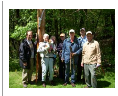
Volunteers help cut vines at Hartwood

That's it...see you there. RSVP to Hartwood's Office 412-767-9200